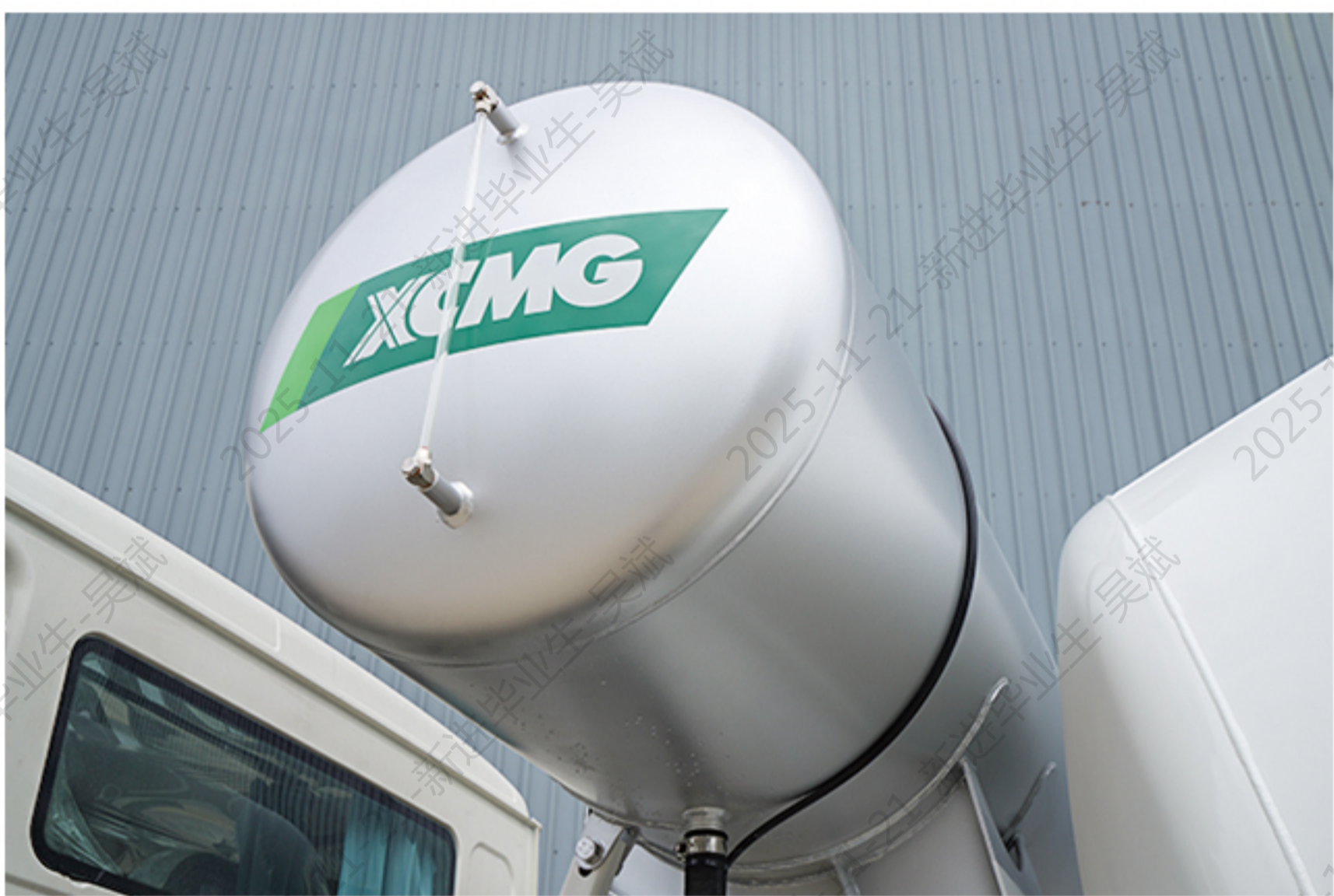
Large capacity water tank