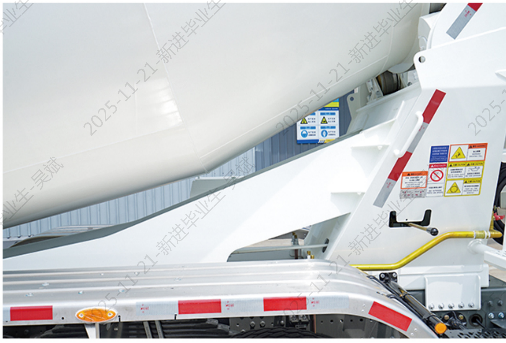
Integral cable-stayed beam structure frame