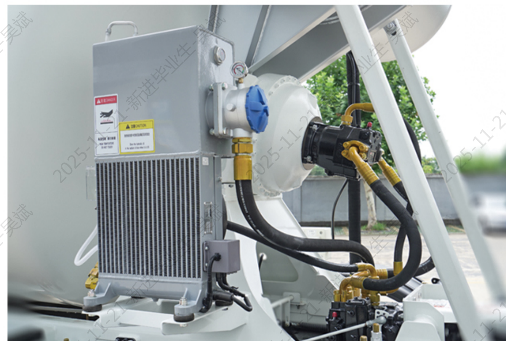
Major brand pump, motor and gear reduce