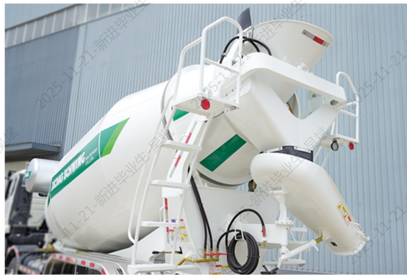
Unique C-shaped rear bulkhead structure Double-sided inclined ladder