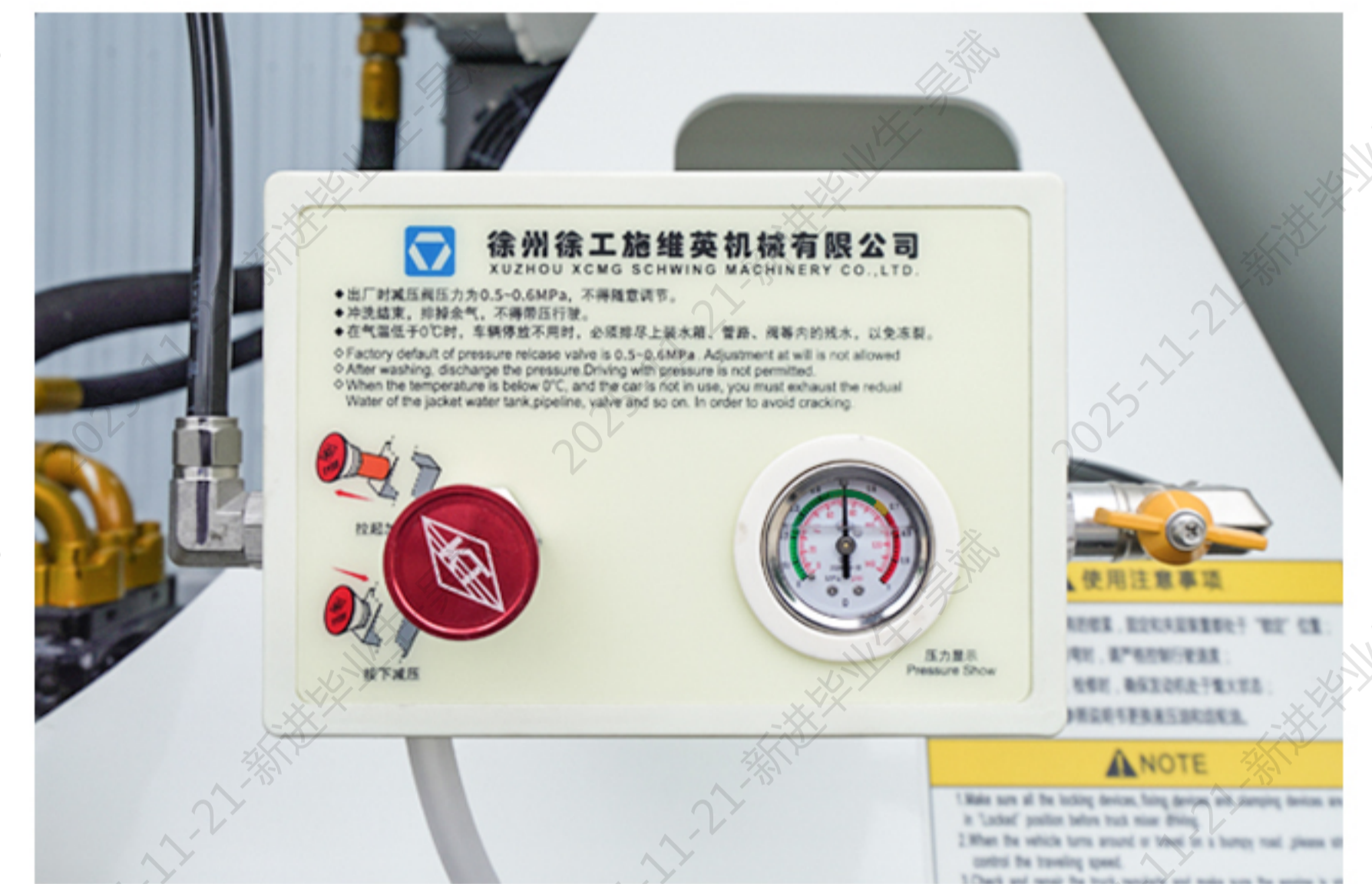
Leak-proof pneumatic control box