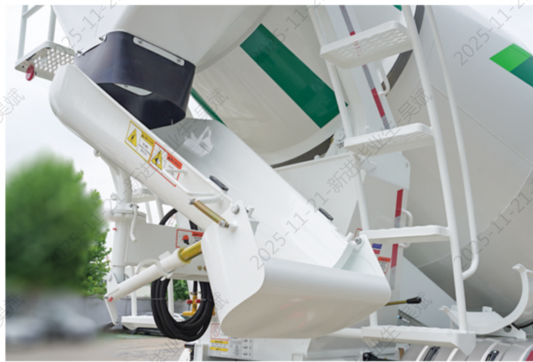
Humanization design of receiving hopper